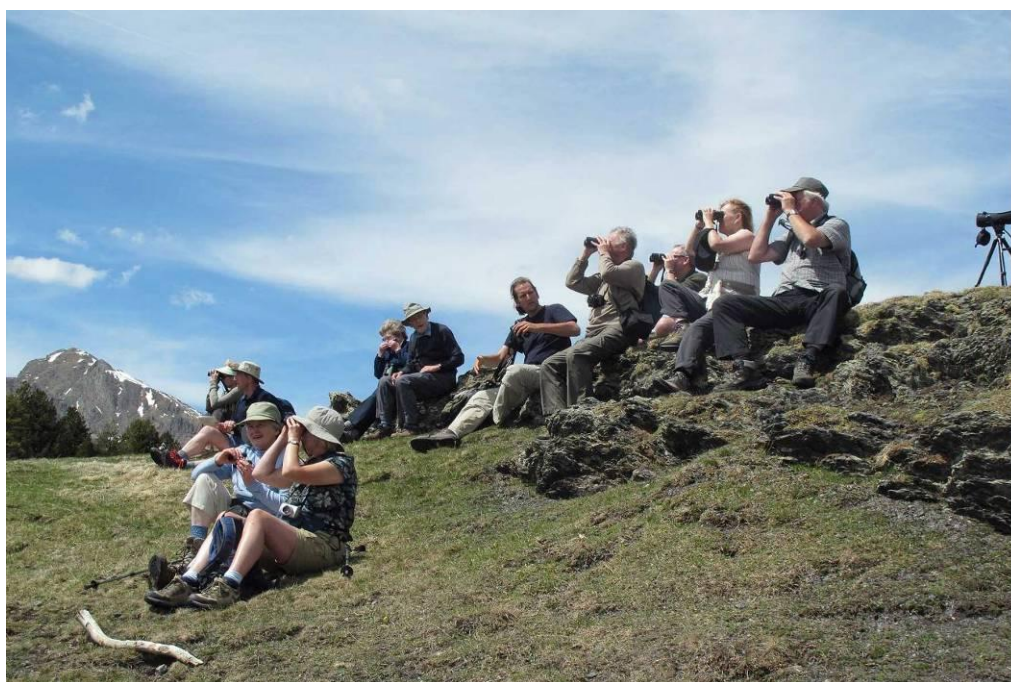
Admiring the views from the Mirador de Fogueruix