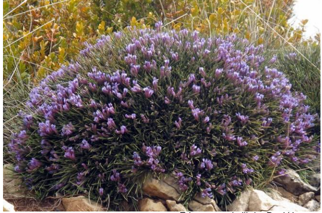
Erinacea anthyllis