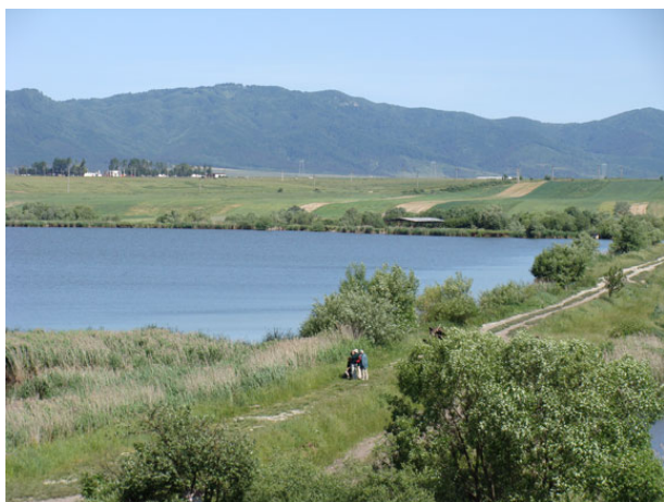
Dumbrovitsa Fishponds near Brasov