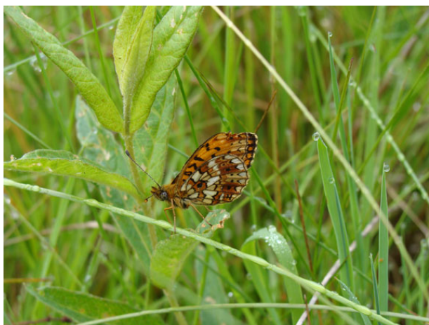
Small Pearl-bordered Fritillary